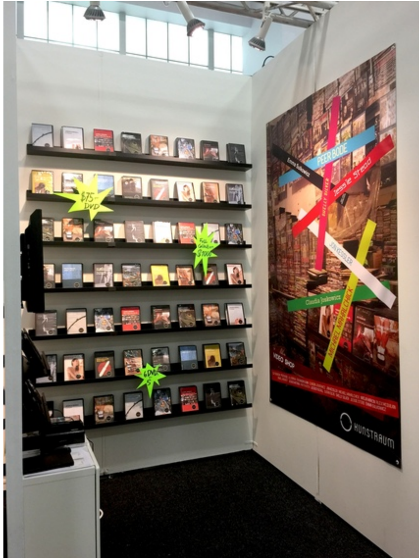
Video Shop, 2016