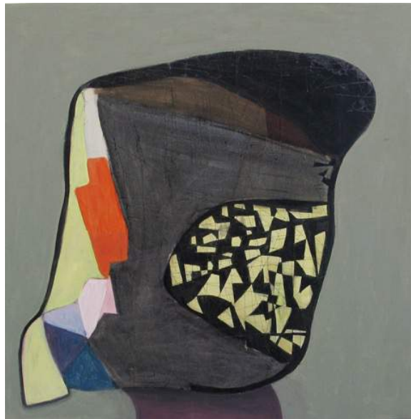
Brenda Goodman, Something to Say (com), 2017, oil on wood, 32 x 33 inches, courtesy of the artist