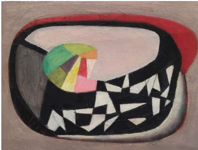
Brenda Goodman, Shine on Me, 2017, oil on paper, 6 x 8 inches