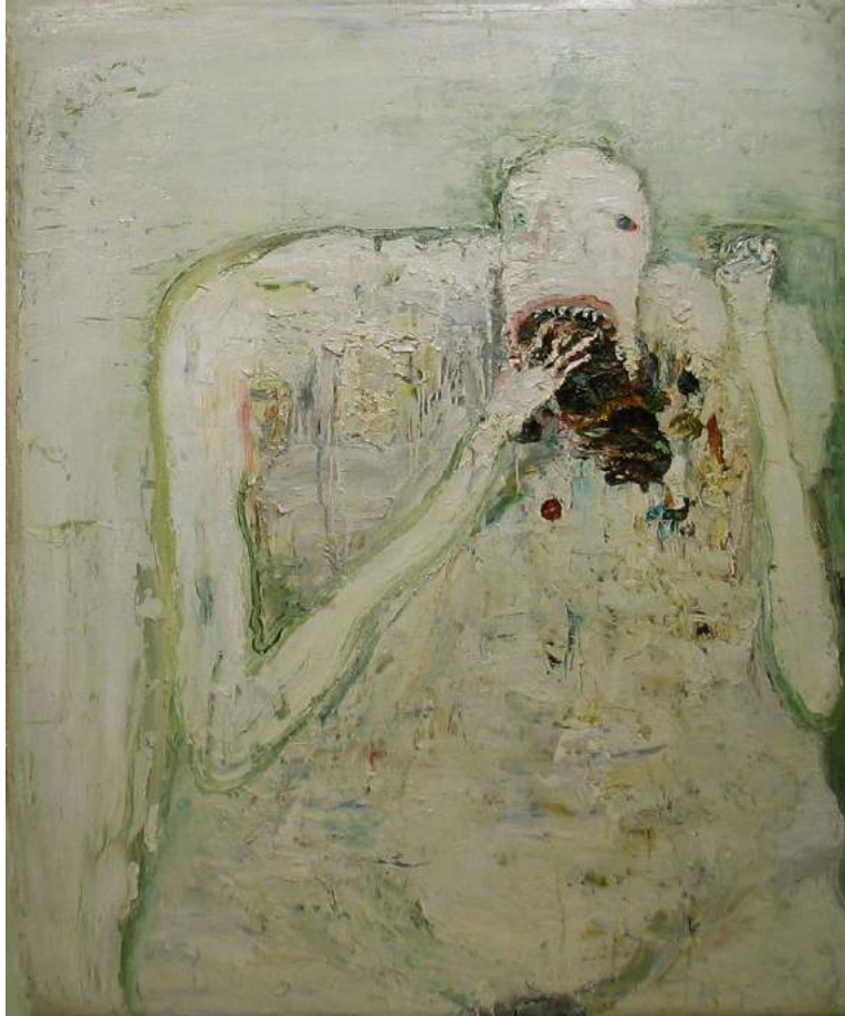
Brenda Goodman, Self-Portrait 13, 1994, oil on wood, 48 x 40 inches, courtesy of the artist