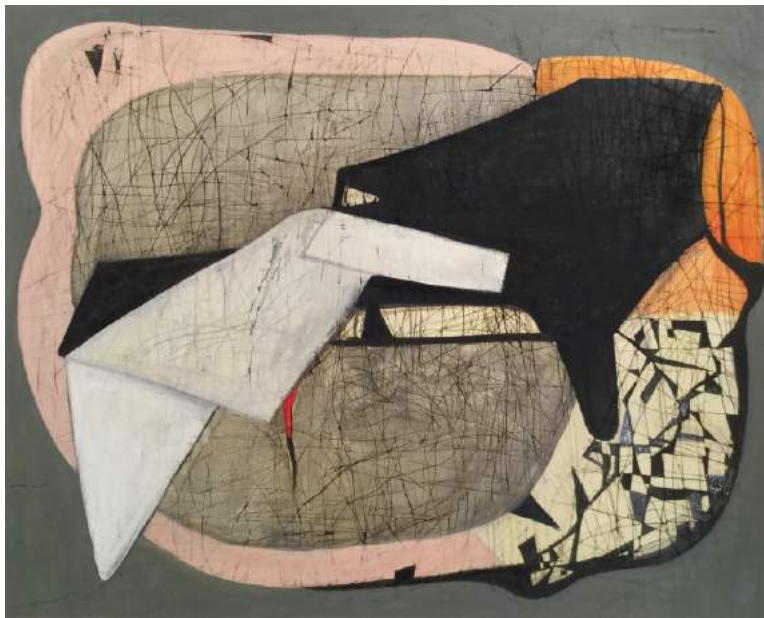
Brenda Goodman, Watching and Waiting, 2017, oil on wood, 32 x 40 inches, courtesy of DAVID&SCHWEITZER Contemporary

(Brenda Goodman: In a New Space is on display at DAVID&SCHWEITZER Contemporary from September 8 to October 1, 2017.)