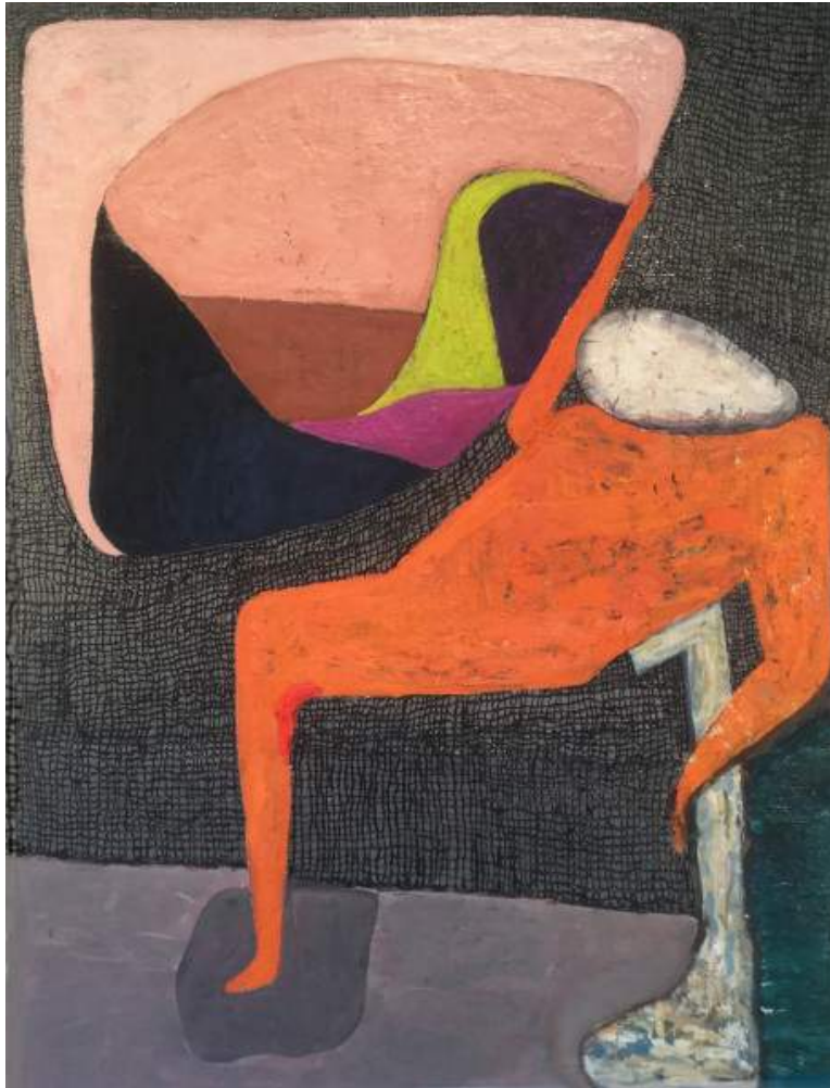
Brenda Goodman, Holding a Dream, 2016, oil on wood, 59 x 45 inches, courtesy of DAVID&SCHWEITZER Contemporary

when I was a student and see a shape that pops up in other works made many years later. Certain shapes and forms seem to resonate with different people.”