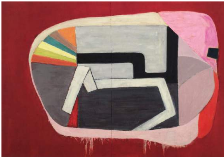
Brenda Goodman, Siblings, 2017, oil on wood, 50 x 72 inches

The paintings in In a New Space , while a definite departure from previous works, aren't entirely from out of left field stylistically: while the colors are purer, the boundaries more clearly delineated, the overall compositions tighter and more centralized, the forms themselves harken back to older parts of Goodman's oeuvre. The craggy shapes of her 2009-2010 Troubled Waters series and the bold black outlines of her work from just two years prior come to mind, as do the mixture of geometric and rounded edges from her abstractions of 2007-2009. This aspect of continuity isn't intentional, but certainly isn't an accident. As Goodman says, "I know that certain shapes and forms reoccur in different incarnations throughout the whole span of my work. You can look at a painting I did