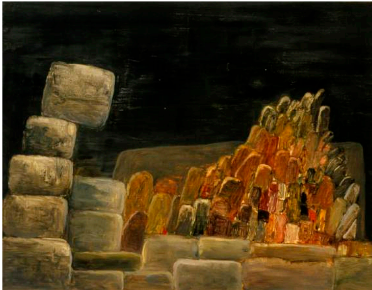
Brenda Goodman, After September 11 (3), 2001, oil on paper 15 x 20 inches